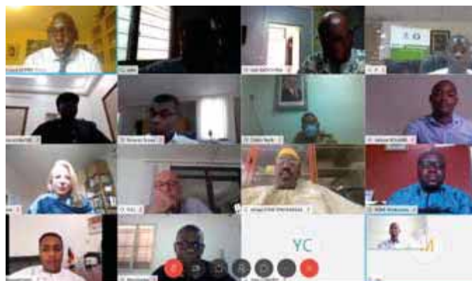
Meeting between the WAPIS Programme team and Single Points of Contact held on 22 May 2020

During the meetings, the SPOCs reassured the WAPIS team that they were committed to continuing the programme activities. In turn, the WAPIS team reiterated its availability to help wherever it could, despite the situation, and to make the system operational in each country. Satisfied with the effectiveness of this new method of holding discussions, the various parties agreed to repeat this exercise in order to enhance the effectiveness of the programme's activities in the participating countries.