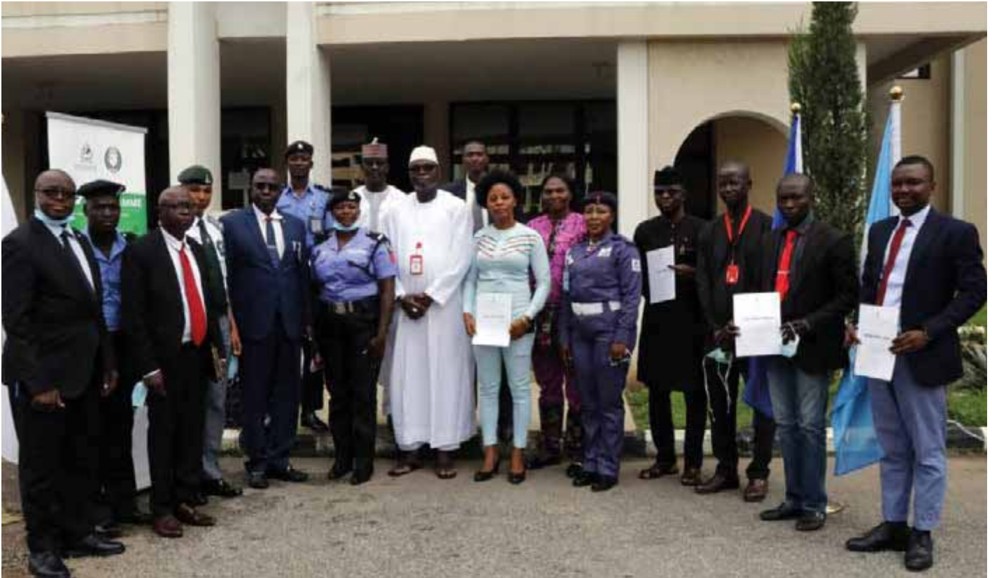
Training of law enforcement officers in Abuja, Nigeria, 7 June 2020

The WAPIS Programme trains up law enforcement officers and hands over preliminary equipment in Nigeria.