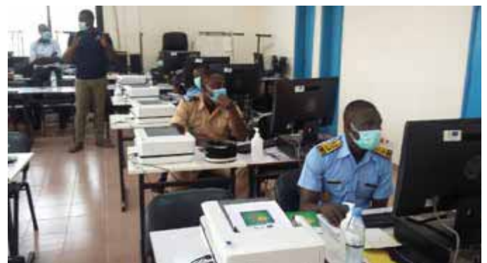
Training of law enforcement officers in Lomé, Togo, 16 October 2020

It should be noted that training on the use of WAPIS was also delivered in Senegal and Togo in October 2020. Other training courses will take place in Chad, Guinea, Gambia and Liberia by the end of 2020.