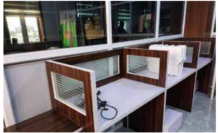
Renovation work on the future DACORE premises in Nigeria

The renovation work was directed by the WAPIS team and local companies, along with the authorities of the participating countries which supplied suitable premises that met the criteria laid down by the programme.