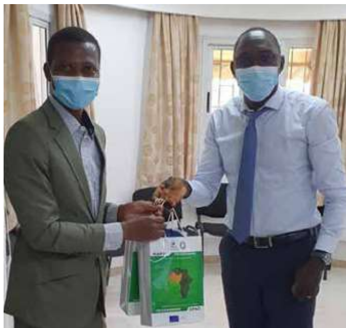
Visit of the WAEMU community Visa Officer, Abidjan, 22 September 2021

In view of the above, INTERPOL was asked for assistance because of its expertise and experience in implementing the WAPIS Programme in the region. Individual and team meetings have provided an opportunity to discuss the challenges encountered in implementing WAPIS and, especially, to make recommendations to the expert on how to implement the UEMOA project.