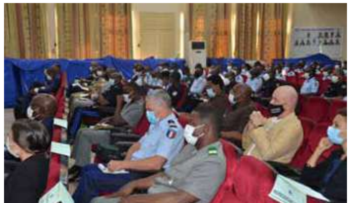
Photo of the opening ceremony, Cotonou (Benin), 11 October 2021

In order to make WAPIS accessible to the participating countries, INTERPOL is planning to organize several information and awareness-raising sessions from the start of 2022.