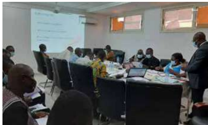
Training IRAPOL officers, Ouagadougou (Burkina Faso), 17 November 2021

A number of law enforcement agencies, including the Police and the Gendarmerie, were represented during this training.