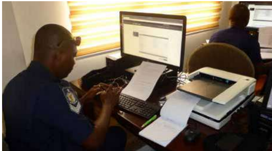
Police officers in Ghana's police service working in the WAPIS centre, Accra (Ghana)

The WAPIS centre (DACORE) and INTERPOL's National Central Bureau in Accra embody the MoU signed on 28 October 2019 concerning the granting of direct access to INTERPOL's I24/7 information system.