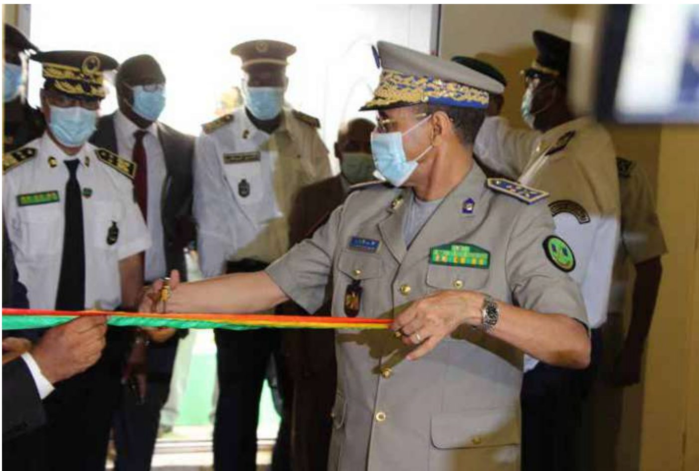
Cutting the ribbon at the inauguration of the national Data Collection and Registration Centre (DACORE), Nouakchott, 1 October 2021

This inauguration ceremony was preceded by a WAPIS National Committee, consisting of various law enforcement agency managers responsible for defining the guidelines for Programme implementation, which adopted the action plan for implementing WAPIS in the country for 2022.